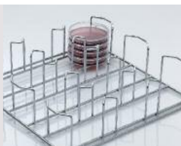
Petri dish holder