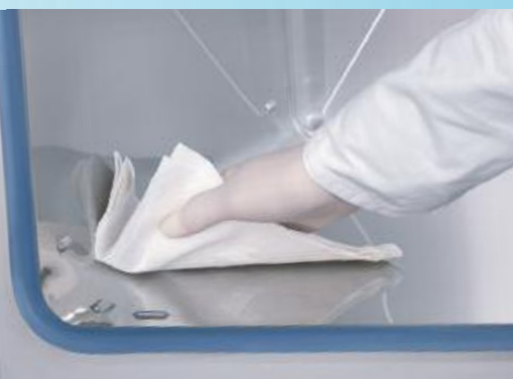
Heratherm microbiological Incubators have a smooth inner chamber with easy to clean rounded corners