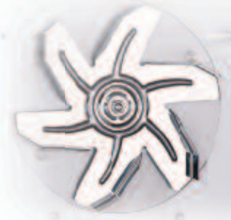
Two speed fan for matching the airflow to your application